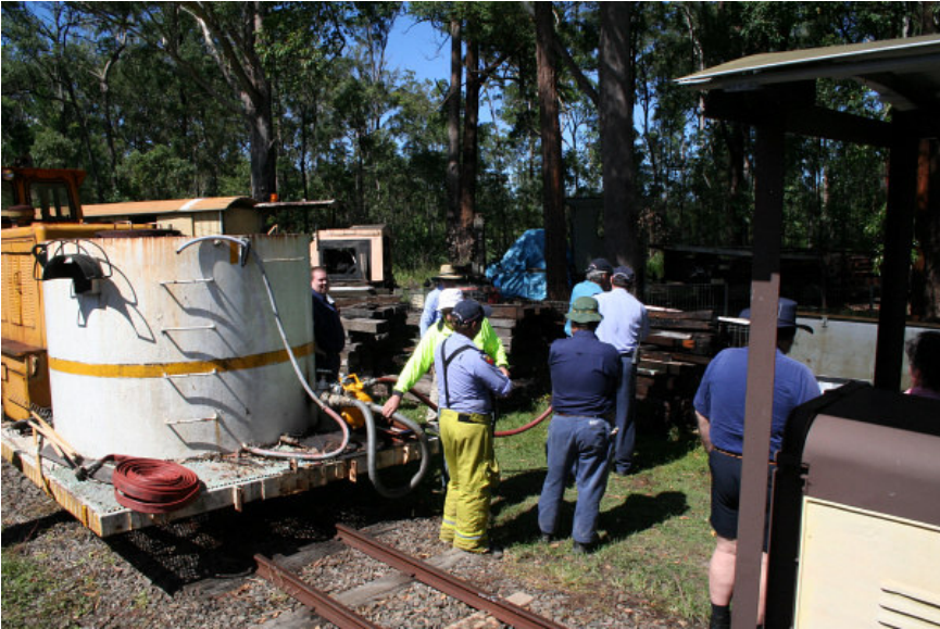
The gang all gather for a chance to have a go at watering the trees with our new fire fighting equipment during the emergency training day on 25 th March .