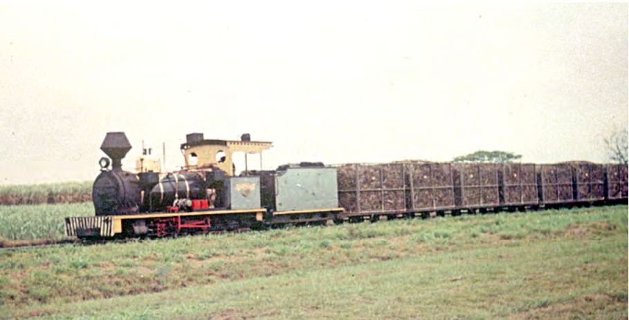
A sister locomotive to ANGRMS' Melbourne, Sydney (0-6-0 Hudswell Clarke of Leeds #1838, 1950) heading to the mill with a rake of full cane bins, likely during the first year Victoria Mill operated only with cane bins, c1970.