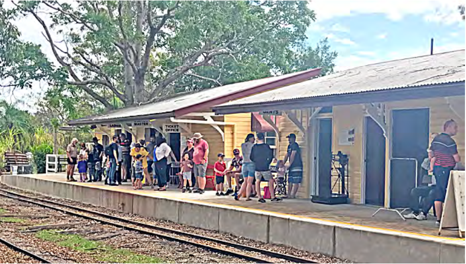
Passengers waiting on the rebuilt Woodford Platform, 20 Oct 2018.