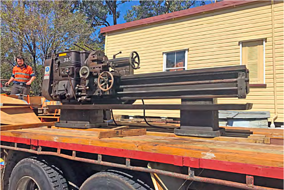
New lathe arrives 15 September 2018. Terry Olsson Photographer.